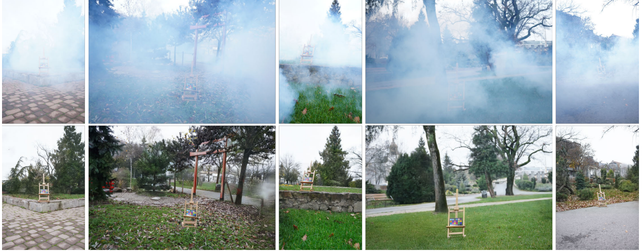
Figure 6. Our results on the validation set of NTIRE 2024 Dense and Non-Homogeneous Dehazing Challenge [5], achieving the best performance in terms of both PSNR and SSIM on the validation leaderboard.