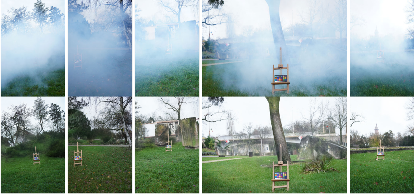
Figure 1. Test Result of our method on NTIRE 2024 Dense and Non-Homogeneous Dehazing Challenge [5]. Our DehazeDCT achieves the second best performance among 16 solutions and is capable to generate visually compelling outputs with vivid color and enhanced structure details.

{thomas25, xiaohongliu, zhaiguangtao}@sjtu.edu.cn, chenjun@mcmaster.ca