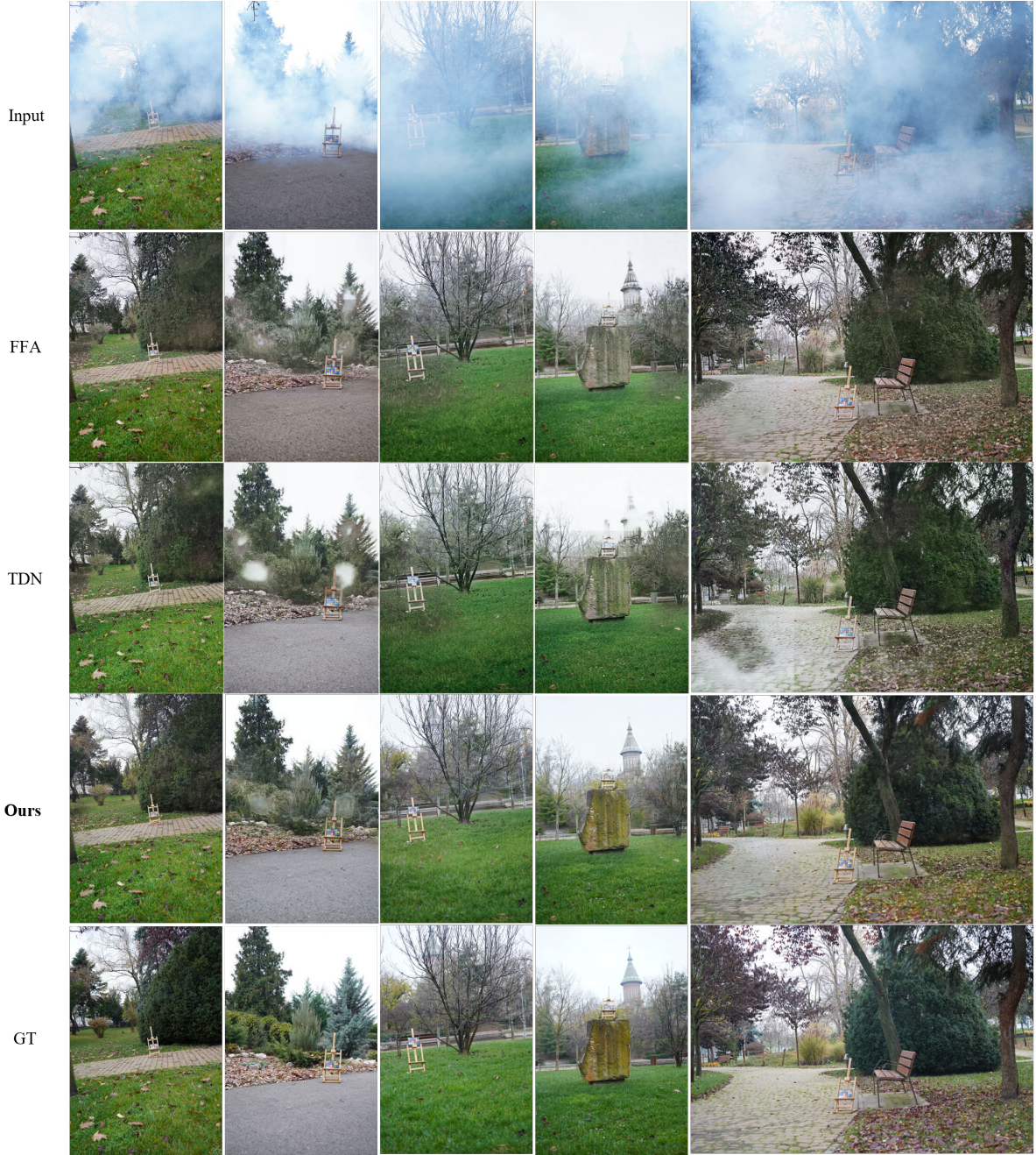
Figure 5. Visual Comparisons on HD-NH-HAZE dataset [4]. Our method exhibits superior haze removal, evidenced by more vivid colors and clearer details, especially in the foliage and background structures.

the significantly lower PSNR and SSIM values indicate that employing the Refinement module alone is insufficient for effective dehazing, underscoring the critical importance of the integration our Dehazing module.