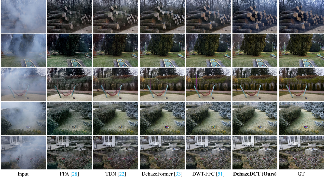
Figure 3. Visual comparisons on NH-HAZE [1] dataset. Compared to other models, our method exhibits higher color fidelity and effective dehazing, yielding compelling results.

pairs with resolution 1200 \times 1600 . As the ground truth for validation and testing data isn't publicly accessible, we utilize the first 20 training pairs for training and use the rest as testing samples. HD-NH-HAZE and DNH-HAZE datasets compose of 40 training pairs, 5 validation pairs and 5 testing pairs of 4000 \times 6000 images. As we can only access the ground truth of training pairs, we again evaluate on the last 5 training pairs and use the rest for training.